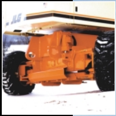
Oscillating Axle for Uneven Terrain