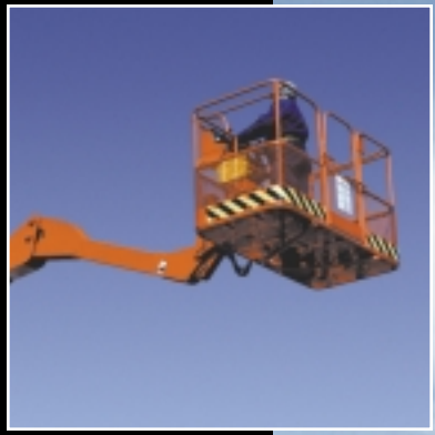
Extend-A-Reach for Added Versatility