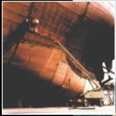
Proven Performance and Reliability